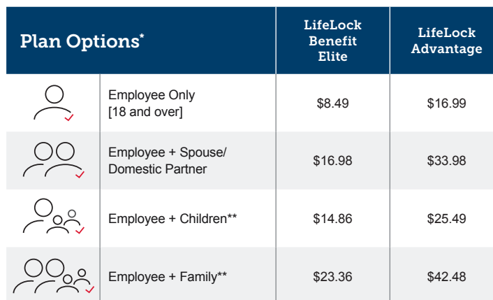
LifeLock service payroll deduction pricing – monthly

LifeLock Junior® (if dependents under age 18 are enrolled) protection helps safeguard your child's Social Security number and good name with proactive identity theft protection designed specifically for children. ††